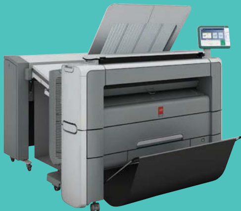
WITH OPTIONAL OCÉ ESTEFOLD 2400 FANFOLD