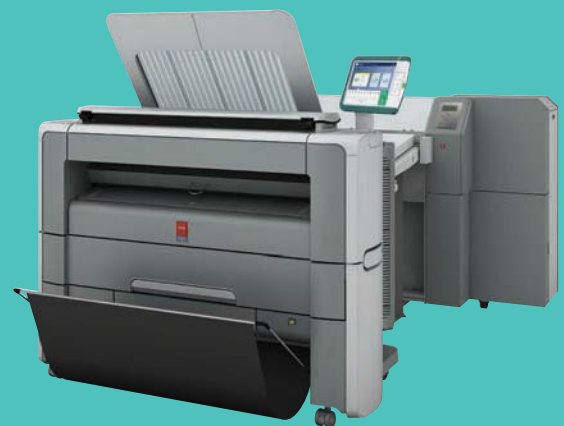
WITH OPTIONAL OCÉ ESTEFOLD 4312 FOLDER AND EXTENDED STACKER