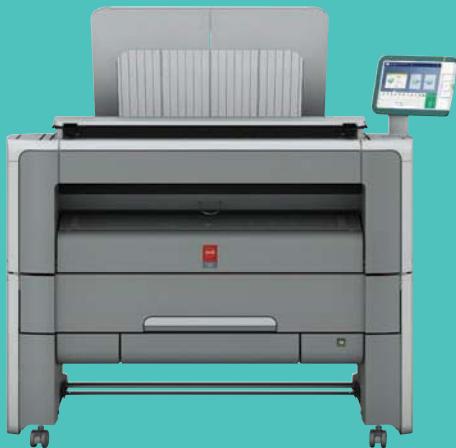
WITH OPTIONAL SCANNER EXPRESS II

You can access your projects' documents directly at the printer using the Océ ClearConnect multi-touch user panel. Are your files on a USB stick, on a network location or in the cloud? Just browse and swipe to your files and print them. In addition, you can scan directly to virtually unlimited destinations in the cloud or your Intranet. When you have a file on your iPad® mobile device, just use the WiFi infrastructure of your company to access the Océ PlotWave 340/360 printer and print via the Océ Publisher Mobile app. Or print from your desktop PC via Océ Publisher Select™ software to manage more complex document sets.