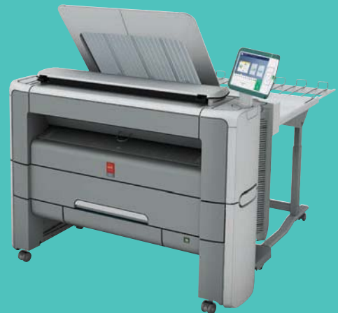
WITH OPTIONAL REAR DELIVERY TRAY